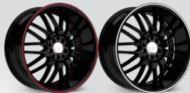
Gloss Black w/ Red Pins