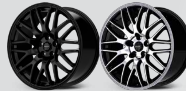
Full Satin Black