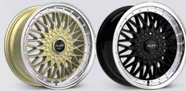
Gold w/ Machined Lip