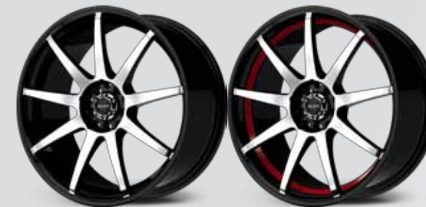
Gloss Black w/ Machined Face