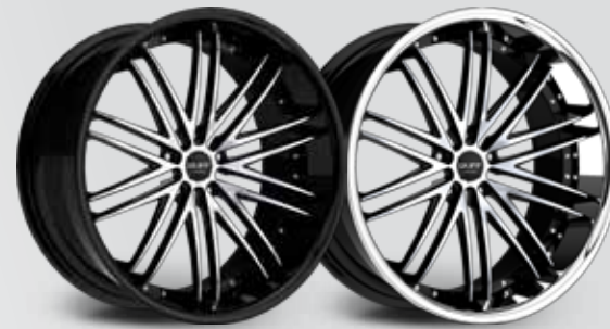
Gloss Black w/ Machined Face