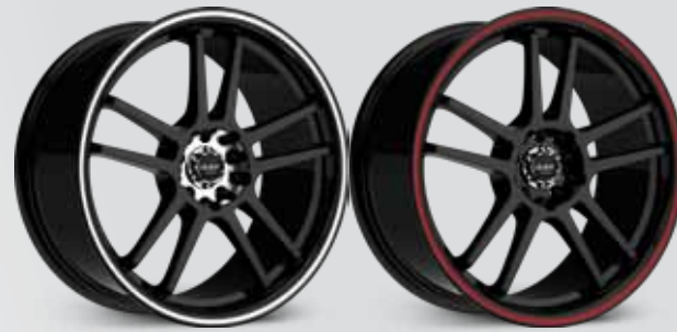
Gloss Black w/ Machined Center & Pin