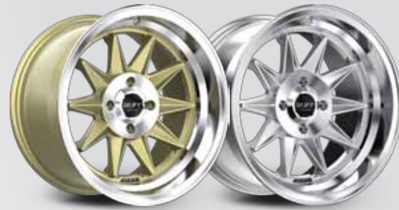
Gold w/ Machined Center & Lip