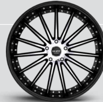
Shown w/ SS Lip (Optional)