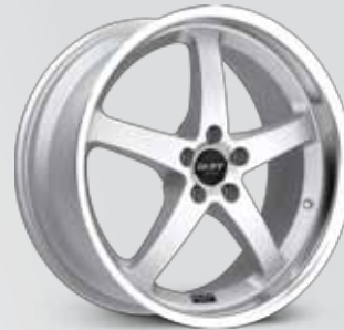
Hyper Silver w/ Machined Lip