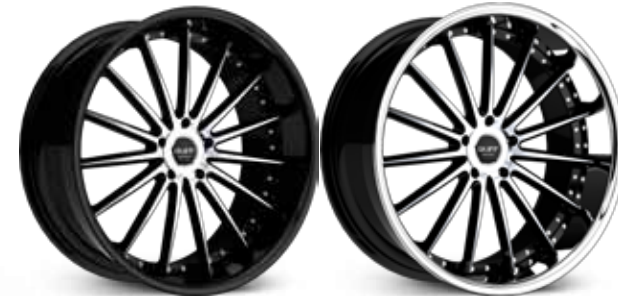
Gloss Black w/ Machined Face