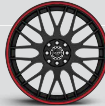
Flat Black w/ Red Pin