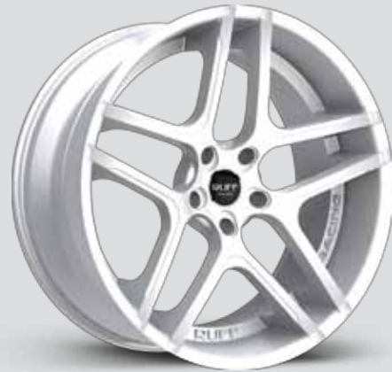
Hyper Silver w/ Machined Face

*also available in Matte Black w/ Machined Face