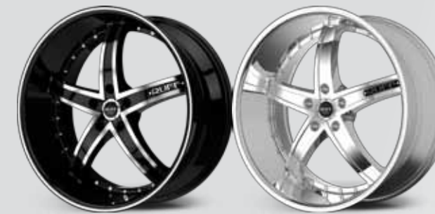
Gloss Black w/ Machined Face & Pin