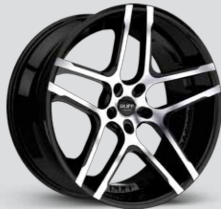
Gloss Black w/ Machined Face