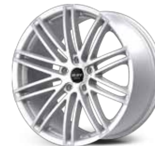
Hyper Silver w/ Machined Face