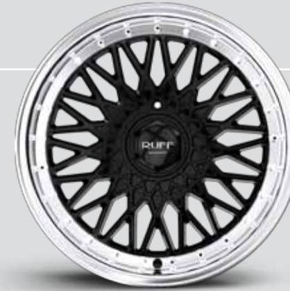
Gloss Black w/ Machined Lip