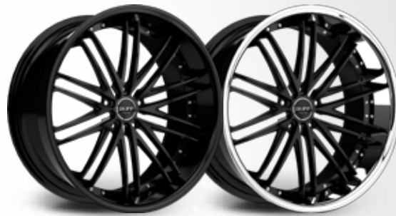
Full Satin Black