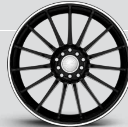
Gloss Black w/ Machined Pin