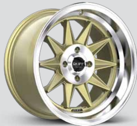
Gold w/ Machined Center & Lip