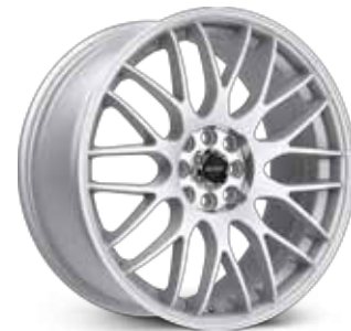
Hyper Silver w/ Machined Pin