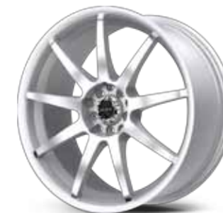
Hyper Silver w/ Machined Face