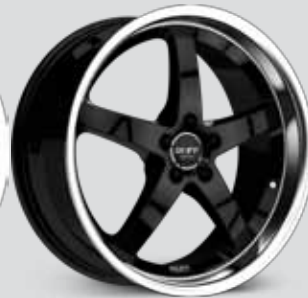
Gloss Black w/ Machined Lip