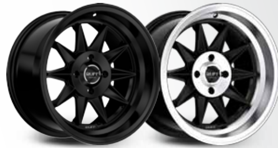
Full Satin Black