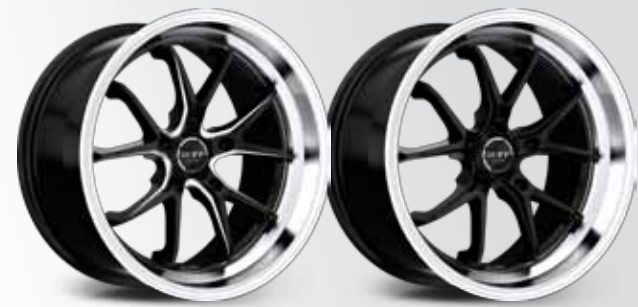
Gloss Black w/ Machined Lip & Milled Spoked