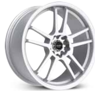
Hyper Silver w/ Machined Pin