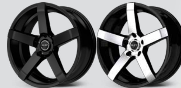
Full Satin Black