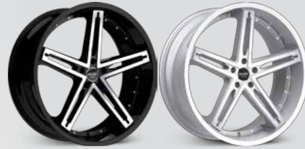
Gloss Black w/ Machined Face