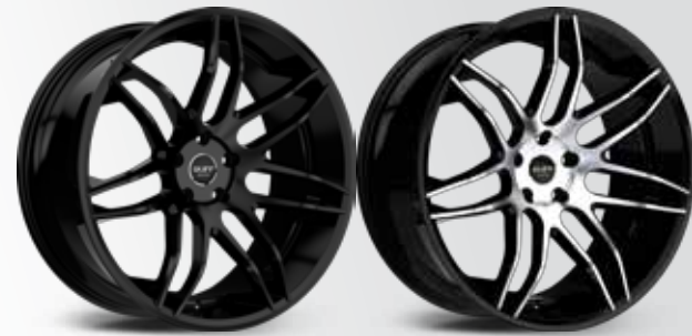
Full Satin Black