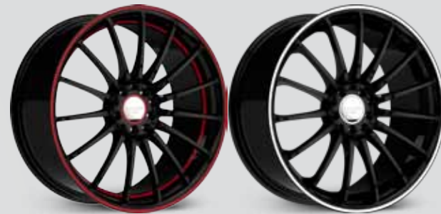
Gloss Black w/ Red Pins