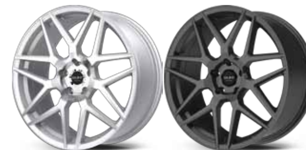
Hyper Silver w/ Machined Face