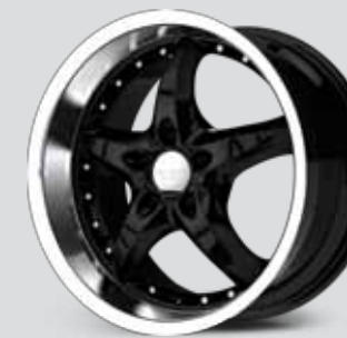
Gloss Black w/ Machined Lip