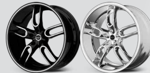
Gloss Black w/ Machined Face & Pin