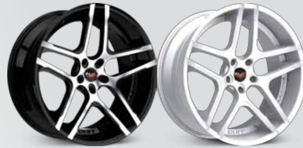
Gloss Black w/ Machined Face