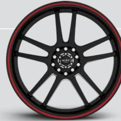
Gloss Black w/ Red Pin