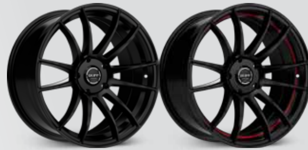
Full Satin Black