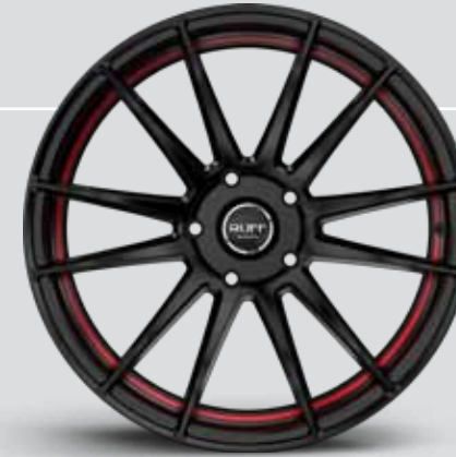
Gloss Black w/ Red Stripe