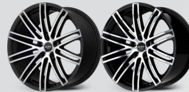
Matte Black w/ Machined Face